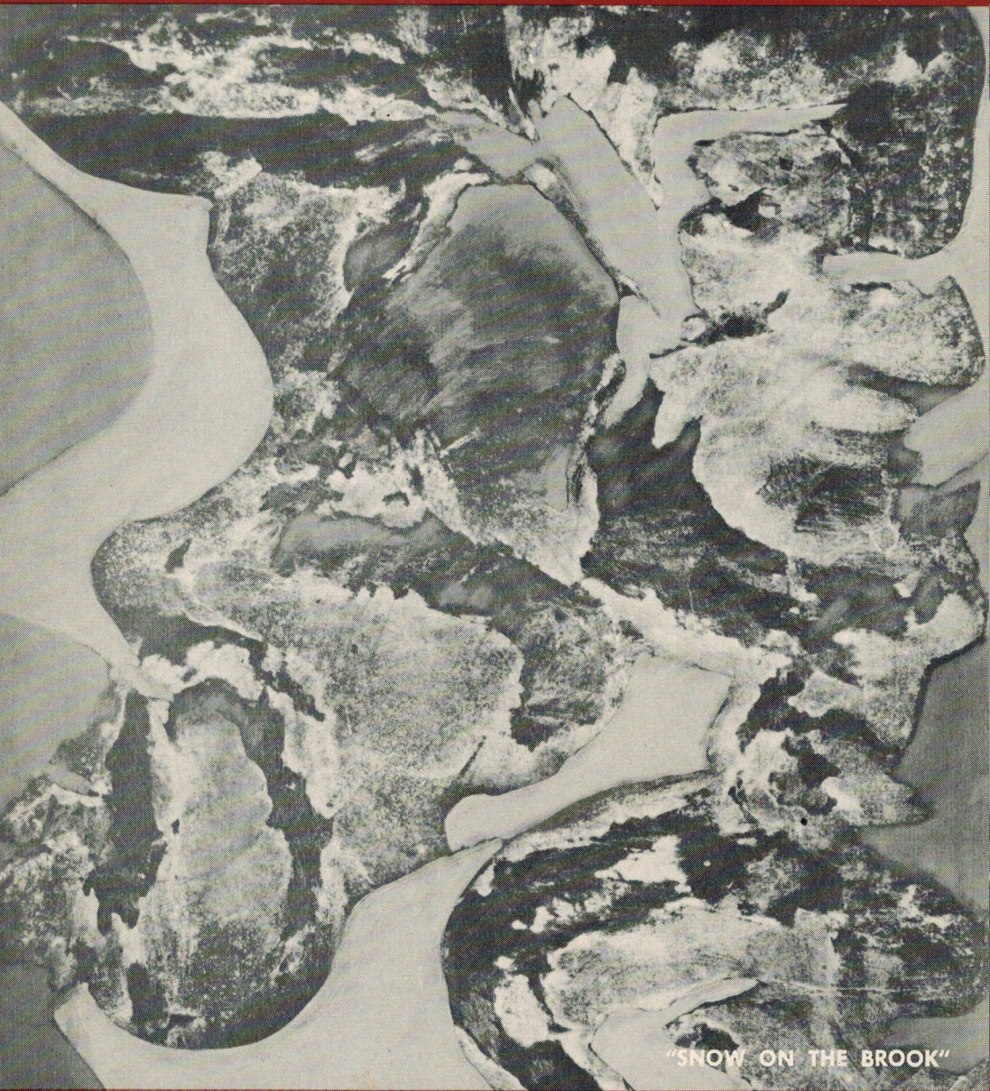
"SNOW ON THE BROOK"